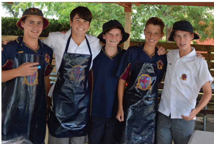
Above: The Caritas Fundraiser at Sion on St Patrick's Day.