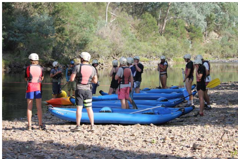
Above: Our Year 9 students at Dargo camp.