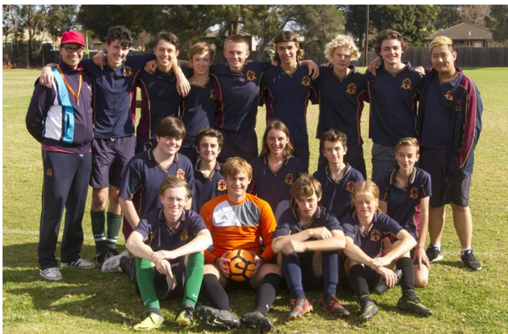
Year 9/10 Soccer Team