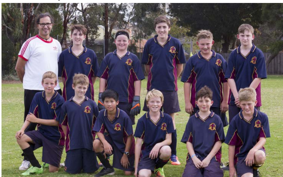
Year 7 Soccer Team