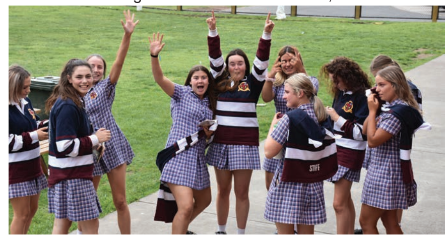
Above: Year 12 students celebrate after the final assembly.

Opportunities in the workplace are very much dependant on the foundation of a good education. Students who take every advantage of the learning they are offered in each year level, and work diligently, set in place the building blocks of their future. There is a direct correlation between completion of Year 12, and future education and the amount of money earned during a working lifetime. So, as the students move to a new year level, and begin a fresh page, it is a chance to begin working hard for the rest of their educational future.