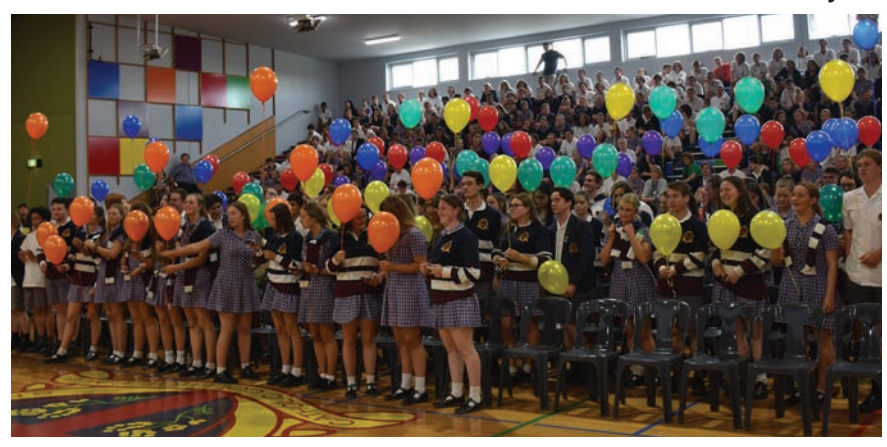
Above: Year 12 students gather at their final assembly in front of the whole College.

Good luck to all. Have a safe and happy Christmas, and summer break.