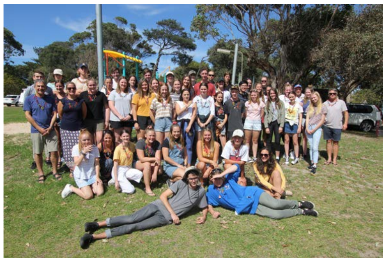
Above - The Tyers Year 12 Retreat group.