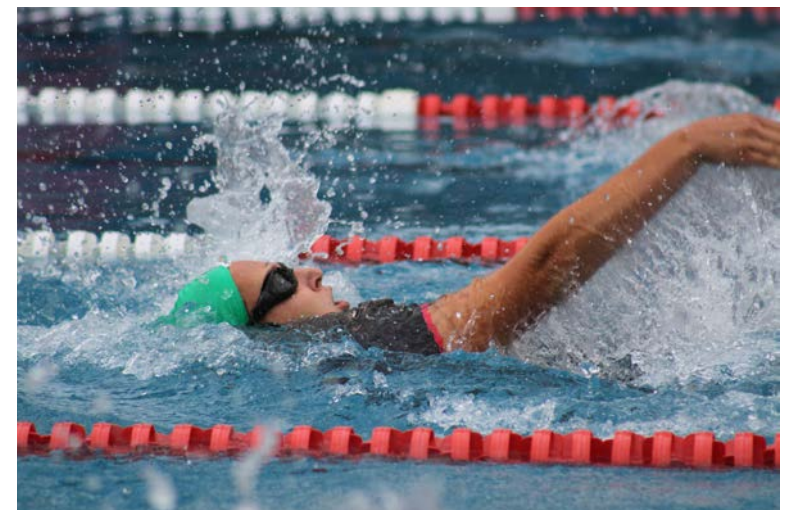
Above - Action from the St. Patrick's Swimming Carnival.