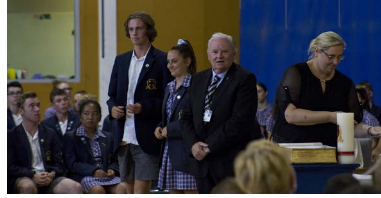
Above: House Captains are presented with their badges.

Below - The College Choir performs at the Opening Mass.