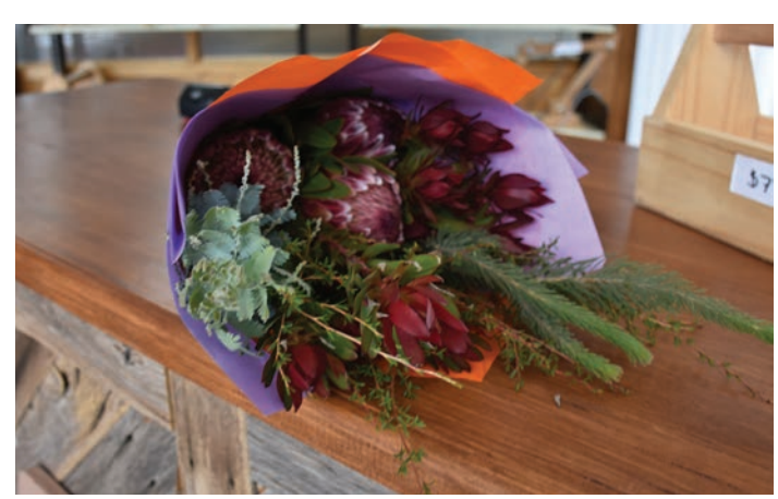
Above - A number of VCAL students were instructed by a local flower farmer in the art of floristry. These arrangements are now put together by our students and available for sale in the shop.