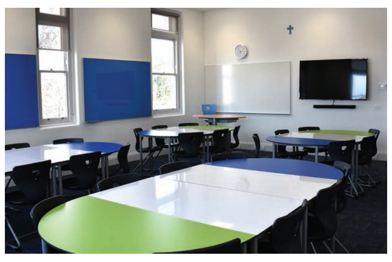
Above: One of the new learning studios in the St. Patrick's refurbishment.

The project cost $11.1 million and we are grateful to the Federal Government for its $2m contribution as well as the support of the Diocese of Sale, Marist