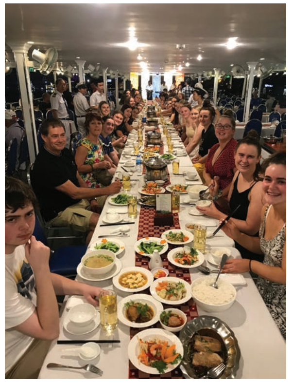
Above: Students and staff on the Vietnam trip enjoy the cuisine on offer in Ho Chi Mihn Citv.

learning progressions will be a key part of our improvement plan for all students over the next four years.