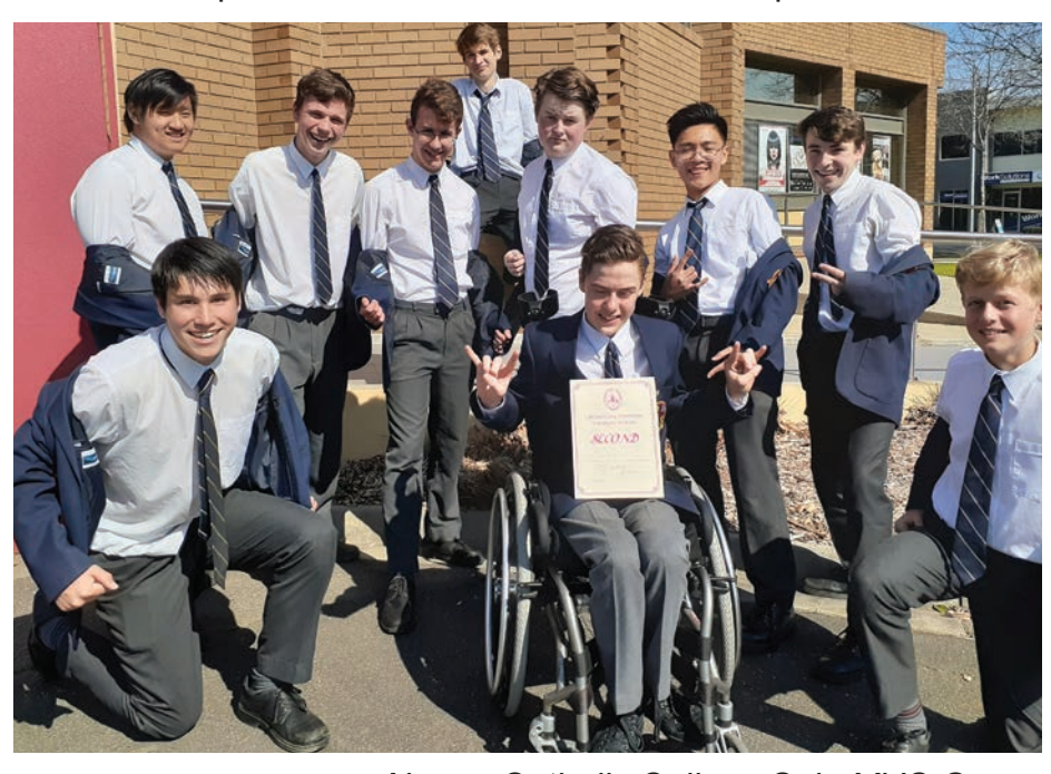
Above: Catholic College Sale MVC Group Below: Sion Singers