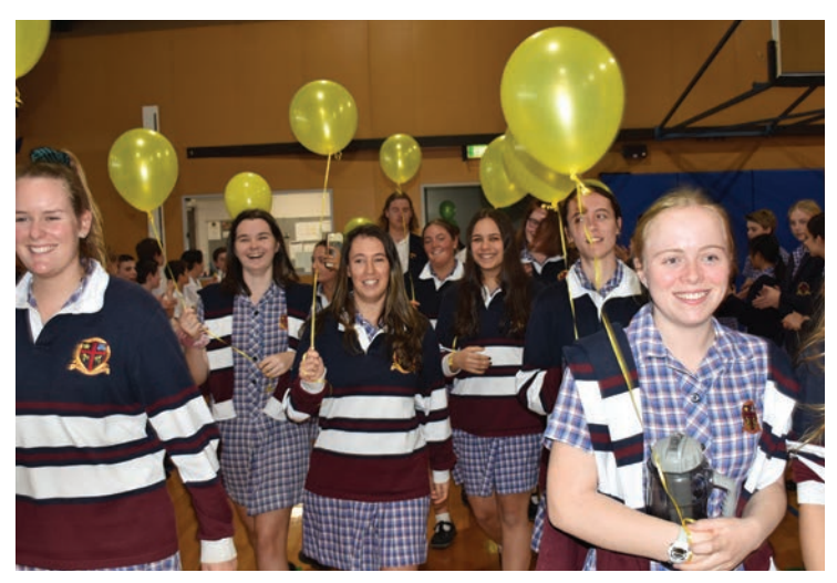
Above: Year 12 students celebrate their final day.