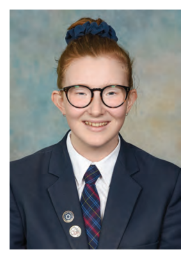
Mackeely Bennett Arts Cabinet