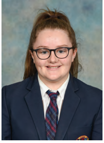
Isobel Morcom Academic Cabinet