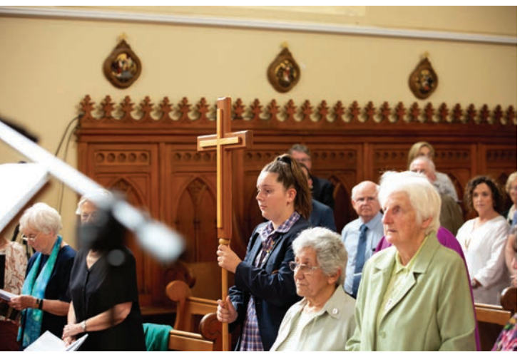
Above and Below - The decommissioning ceremony for the Sion Chapel.

Towards the end of term, the College held a very successfully Parent Student Teacher interview program. A wonderful Year 12 RE seminar day, and a magnificent Year 11 Presentation Ball. 84 students attended the ball, which was live streamed to families. The majority