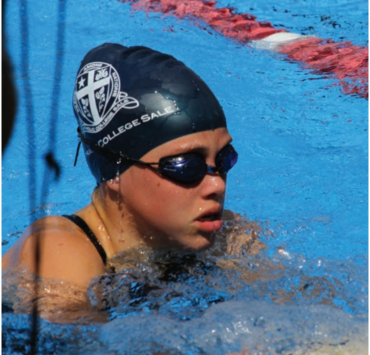
Above - Action from the Intermediate Cricket and the Gippsland Swimming round.