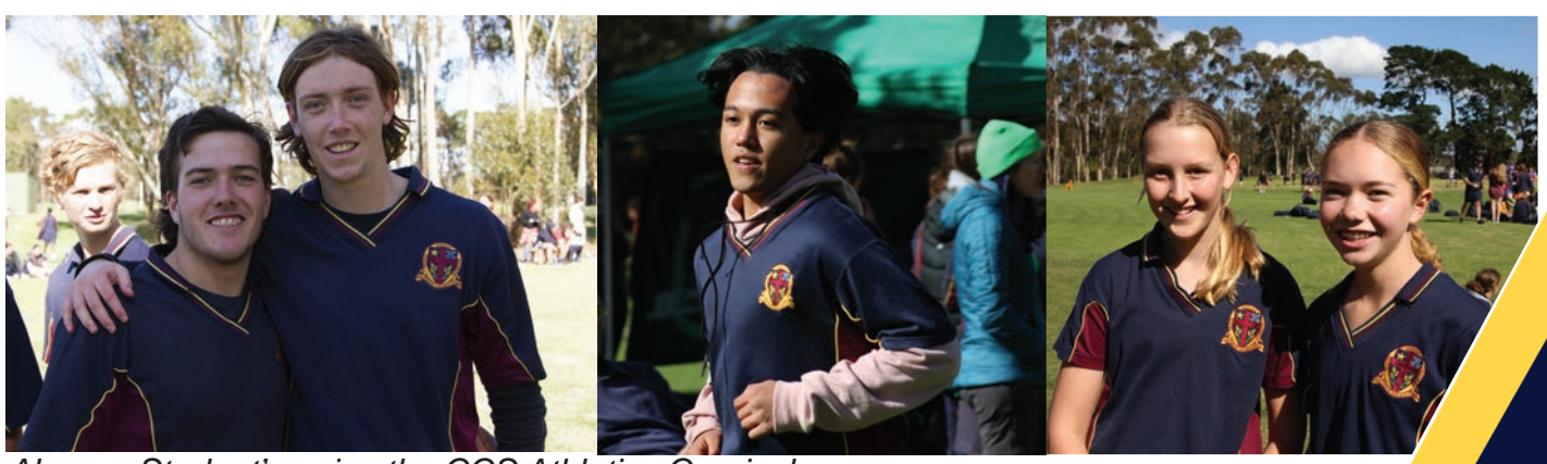
Above - Student's enjoy the CCS Athletics Carnival

"I am strong of mind, gentle of heart and loved by God"