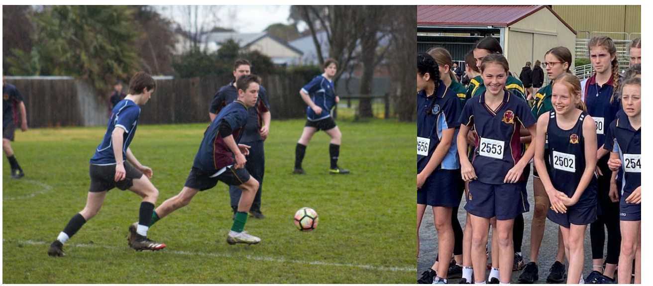
Above - Photos from Senior soccer and SSV Cross Country events held in Term Two