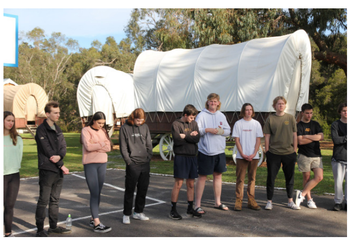
Above - Year 12 Students gather at their Mill Valley Retreat late in Term Two.

• Respect the right of every individual to learn by consistently behaving in a responsible manner in all classes.