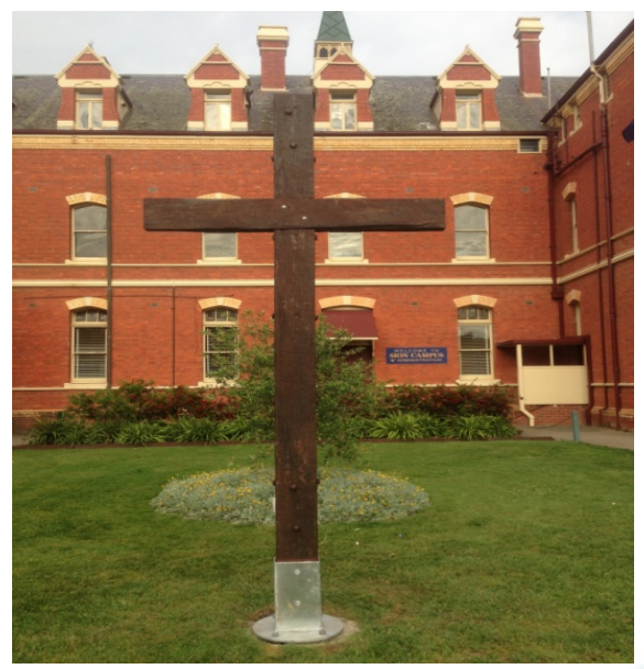
Our Lady of Sion Campus